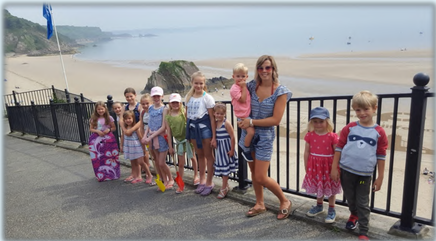
Above: Tabernacle's Sunday School trip to Tenby