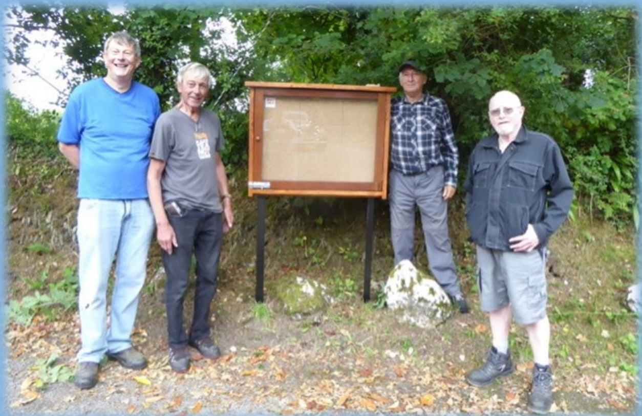
Above: Some members of Sied Dinion Frenni Mens' Shed after completing repairs and refurbishment of the notice board at Llanfyrnach church. This work was carried out as part of a refurbishment scheme of all noticeboards and public benches in the Crymych area for Crymych Community Council.